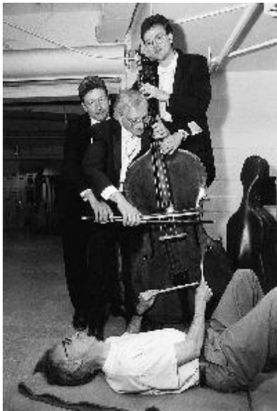
Toronto Symphony Bass Quartet

Celebrate! Bring a party! 4th Annual Children's Concert with Toronto Symphony Bass Quartet Saturday, February 28 2 p.m.