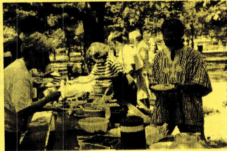
Plan to attend the 1994 Home Coming and put Yourself in the picture.