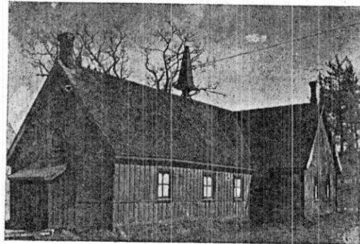
THE FIRST CHURCH