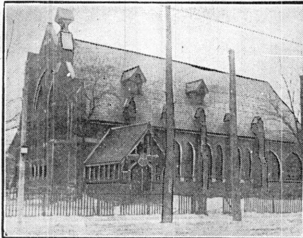
THE SECOND CHURCH