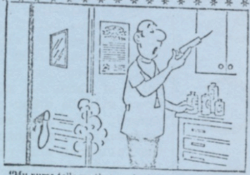
"My nurse tells me that you're in an awful hurry to get back to your office."